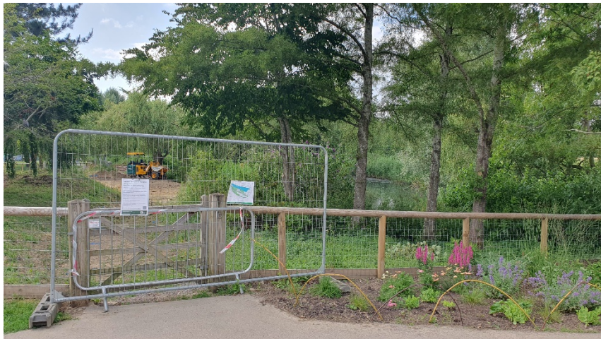
The pond entrance on Sat 1 July.

As you know, works on levelling the pond viewing area and creating a new path have been paused for some time. The work was paused whilst the team looked into some hidden technical difficulties that emerged with the structural wall beneath the new platform. HDC has received advice from various specialists and now have a solution to move things forward.