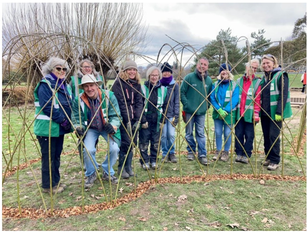
Volunteers who made the playground tunnel (It will be covered with plant growth to form the tunnel, which will be a fun addition to the playground.)

Thank you to everyone! Take a well-deserved pat on the back.