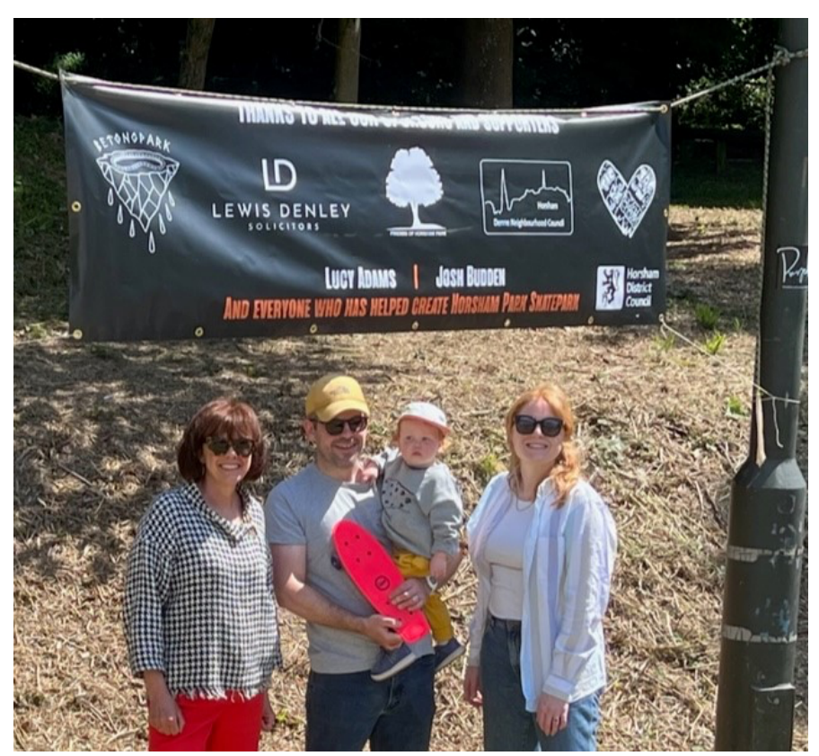
Friends at the opening

The opening of the new skate park proved to be a highly successful day. The sun was shining, extreme sports enthusiasts and families crowded round to watch and gasp at the Team Extreme professional riders showing off their amazing jumps, grabs and spins. It was a very inclusive day with plenty of time for everyone who wanted to use the skate park and get coaching tips from the Team Extreme experts.