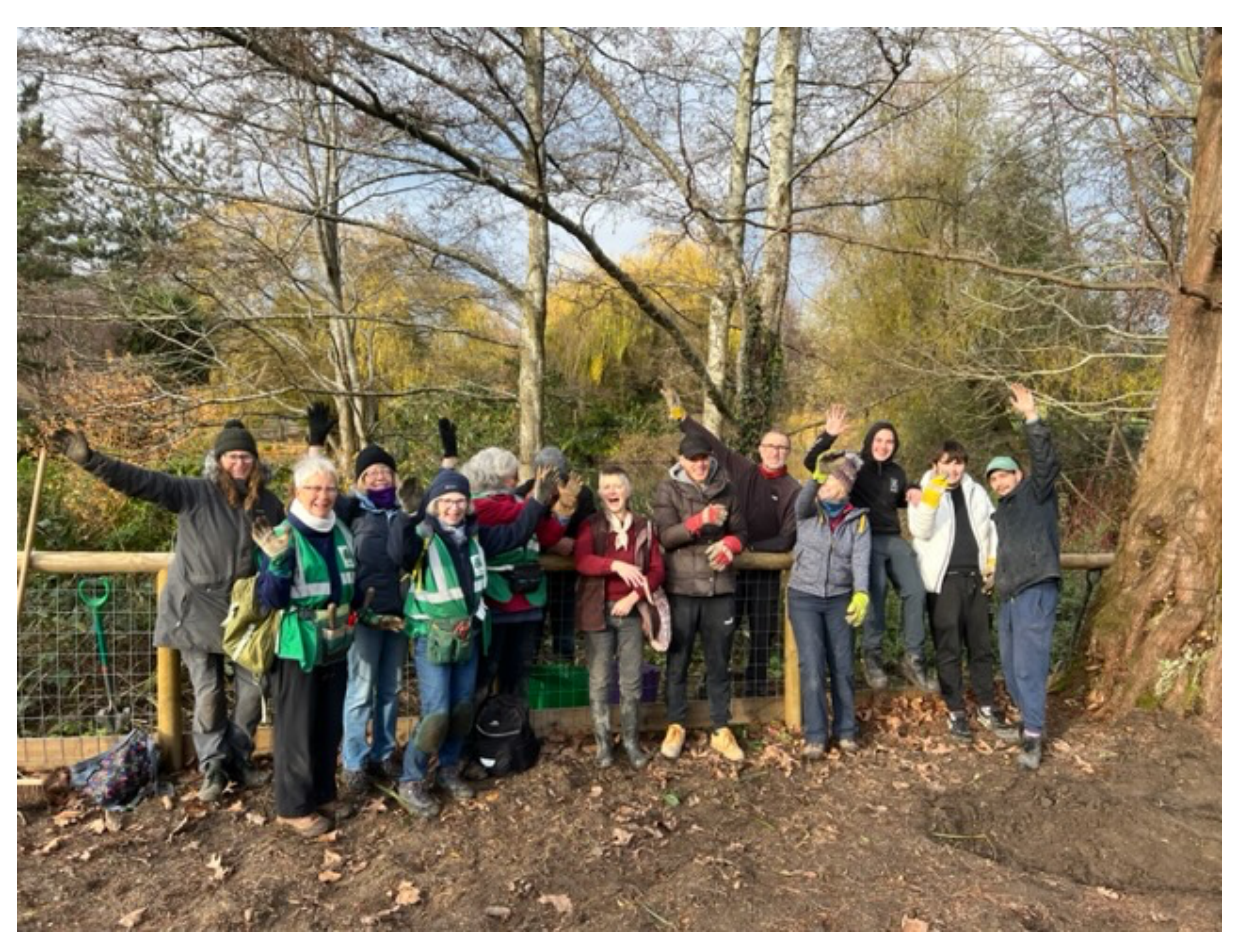
Friends' volunteers clear the pond bed

It's volunteer week 1-7 June so we want to shout out a BIG THANK YOU to the many volunteers who help to enhance, promote and protect Horsham Park.