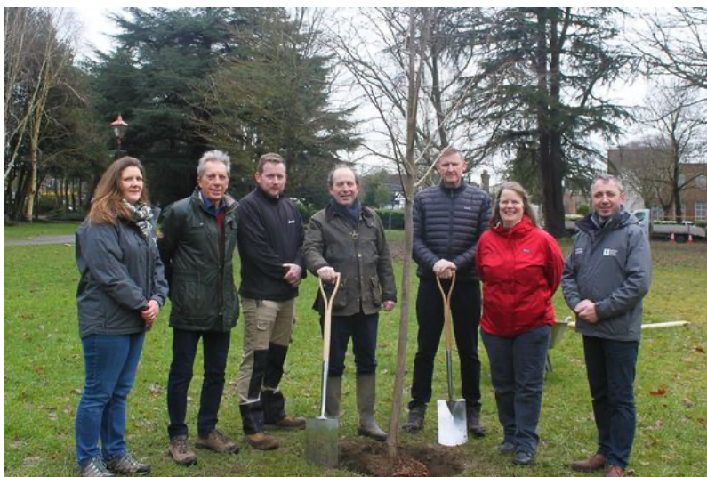
Councillors, the Park Team with Friends of Horsham Park

To mark the Coronation of King Charles III in May, a common Lime tree ( Tilia europaea ) was planted in Horsham Park. It stands just a few yards away from another Tilia europaea , planted in March 2022 to mark the Platinum Jubilee of Her late Majesty Queen Elizabeth II and her Queens Green Canopy.