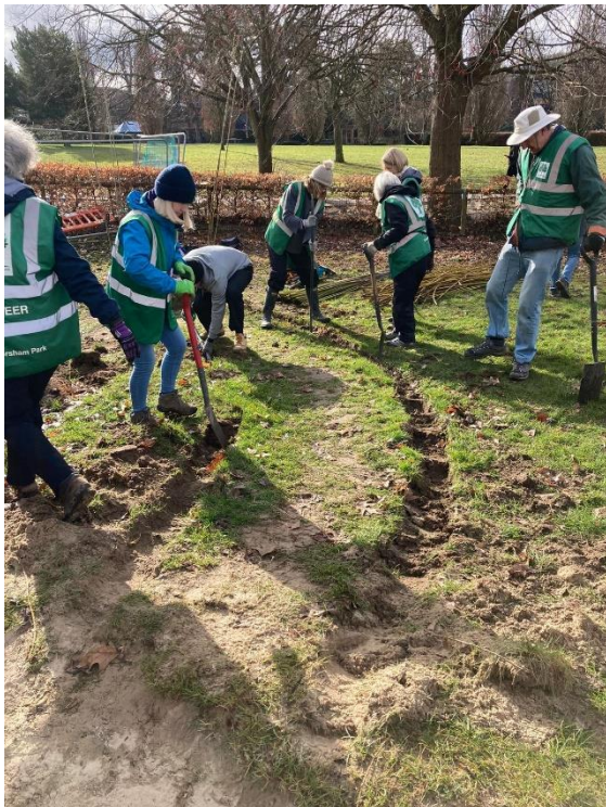
Preparing for the planting