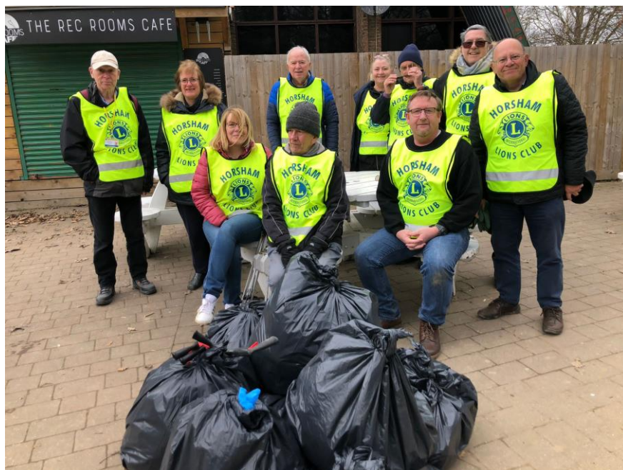
The Horsham Lions with their haul of litter

Last month the Horsham Lions did a fantastic job collecting 11 large bags of rubbish from the Park. Thanks and well done to all who took part!