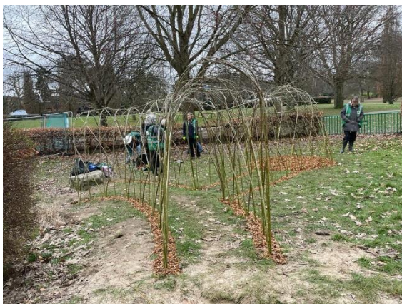
The finished tunnel