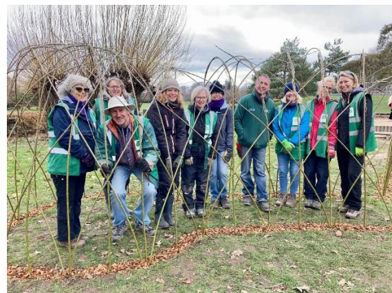
'hiding' in the tunnel.